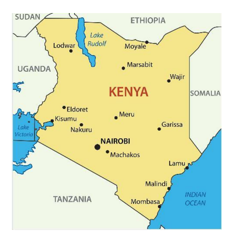
3-5 May 2017